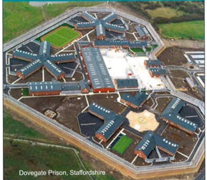
Dovegate Prison, Staffordshire