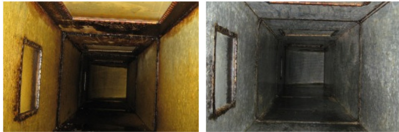
Kitchen extract ducting before (left) and after cleaning

A spokesperson for West Midlands Fire Service said: "We take fire safety compliance very seriously as responding to fire hazards is our business. The first phase of cleaning is now complete and System Hygienics' before and after photographic report and certification of cleanliness confirms that cleaning was achieved to an excellent standard."